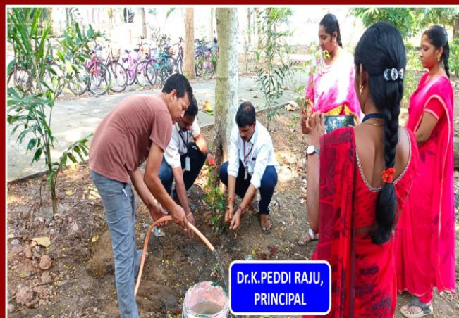
V.K.V. GOVERNMENT DEGREE COLLEGE, KOTHAPETA