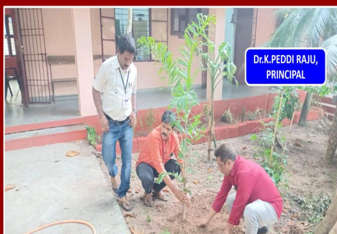
V.K.V. GOVERNMENT DEGREE COLLEGE, KOTHAPETA