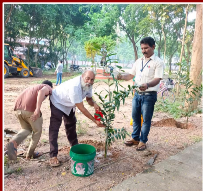
V.K.V. GOVERNMENT DEGREE COLLEGE, KOTHAPETA