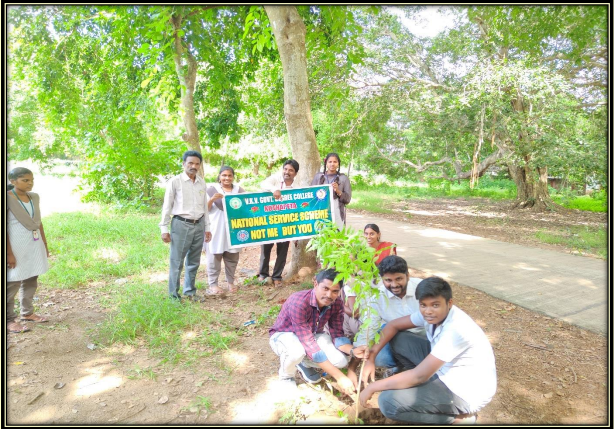
Plantation by Staff and Students