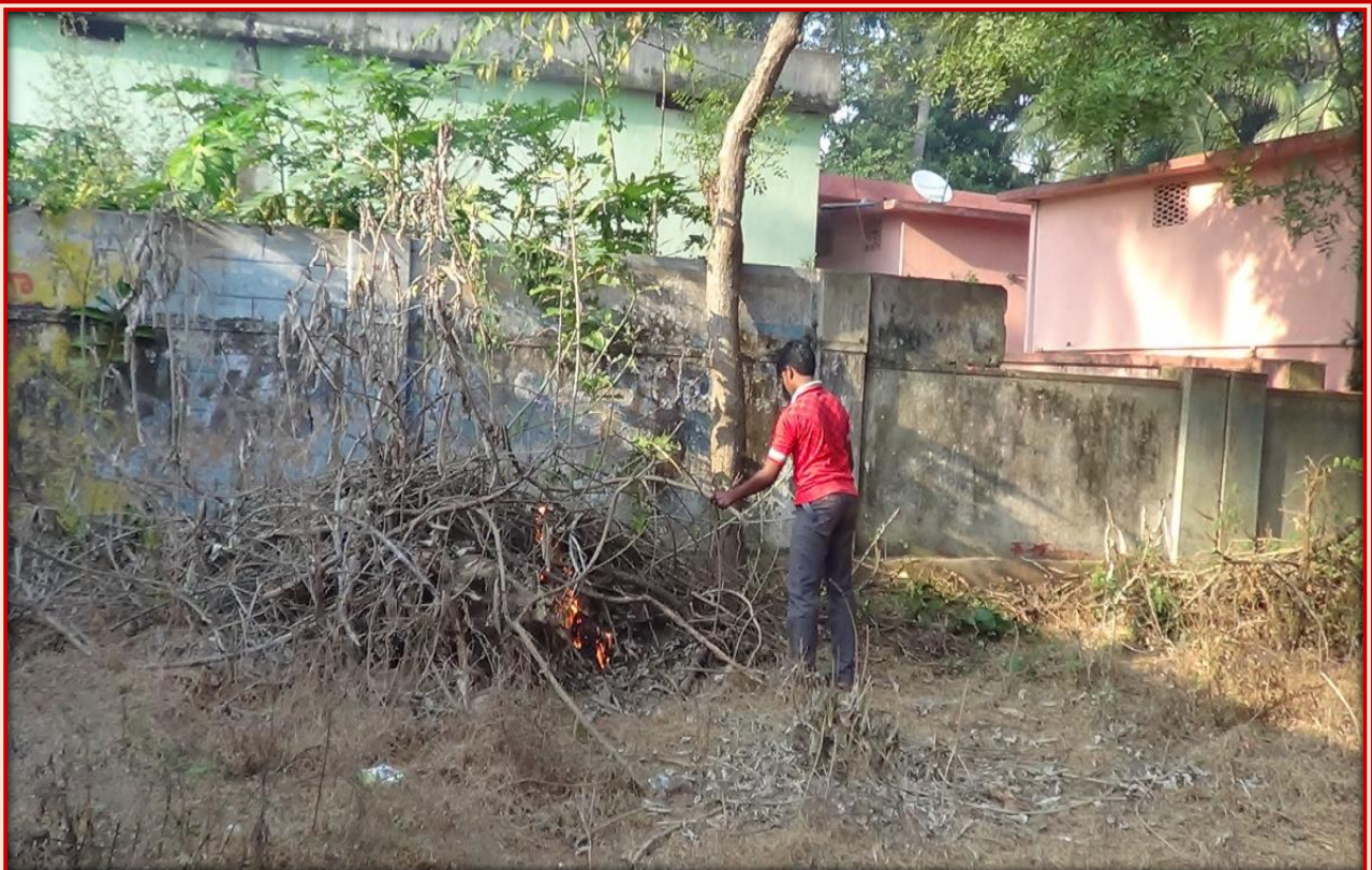
Vice-Principal S. Arun Kumar and Students were participated in clean and green programme in our college campus