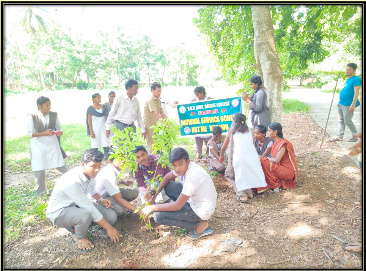
Plantation by Staff and Students