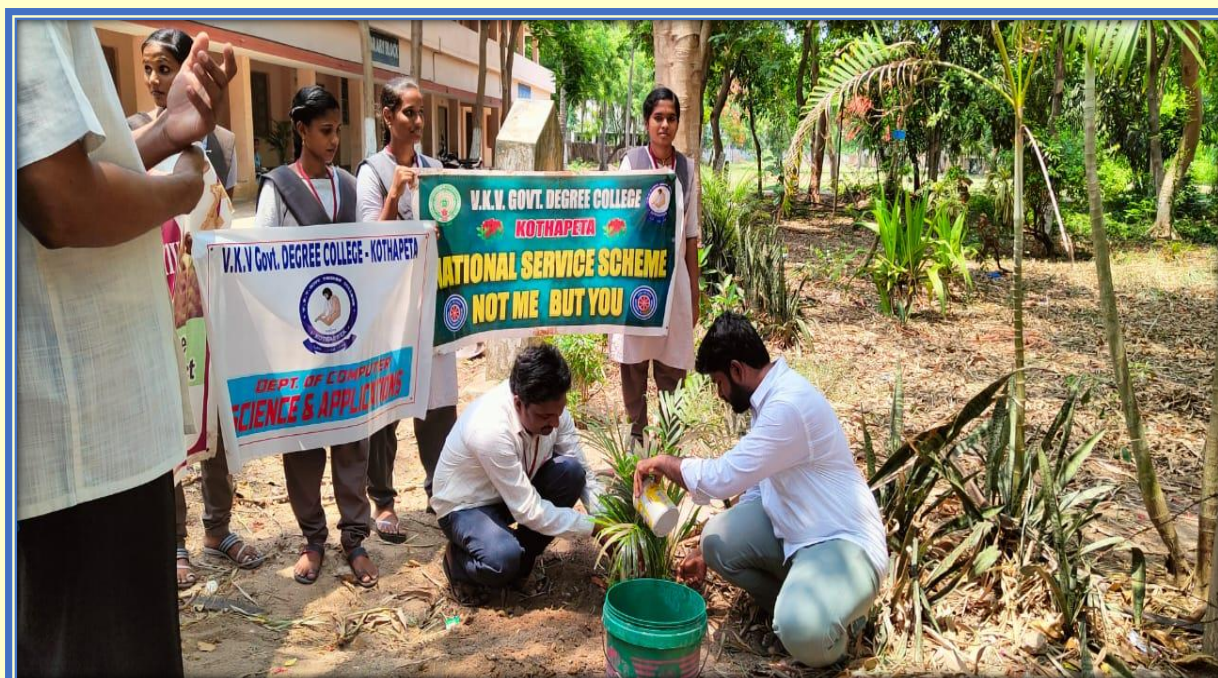
Tree plantation by Teaching and Non-teaching staff