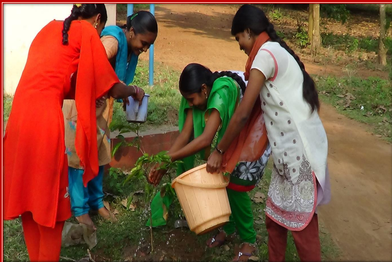
Plantation by the Students