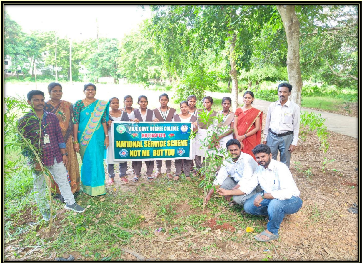
Plantation by Staff and Students