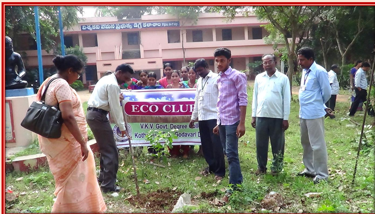
TREE PLANTATION CONDUCTED BY ECO CLUB