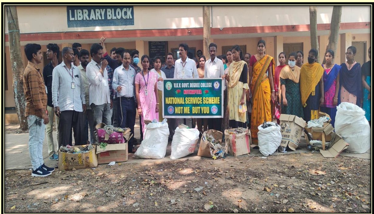
Collected and divided Degradable and Non-degradable waste