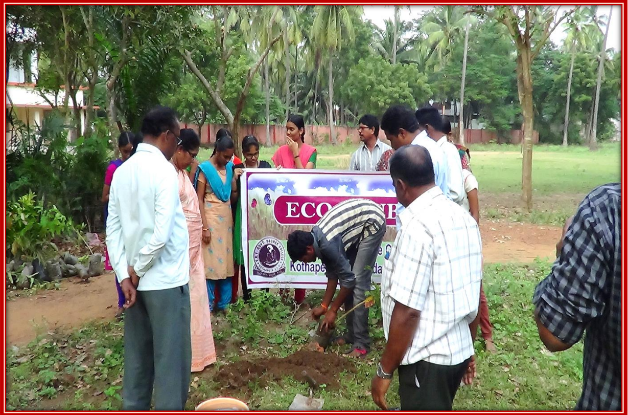
TREE PLANTATION BY STAFF AND STUDENTS