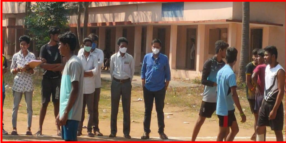
Our Respected Principal Sir & Vice-Principal Sir watching the Game while students are playing