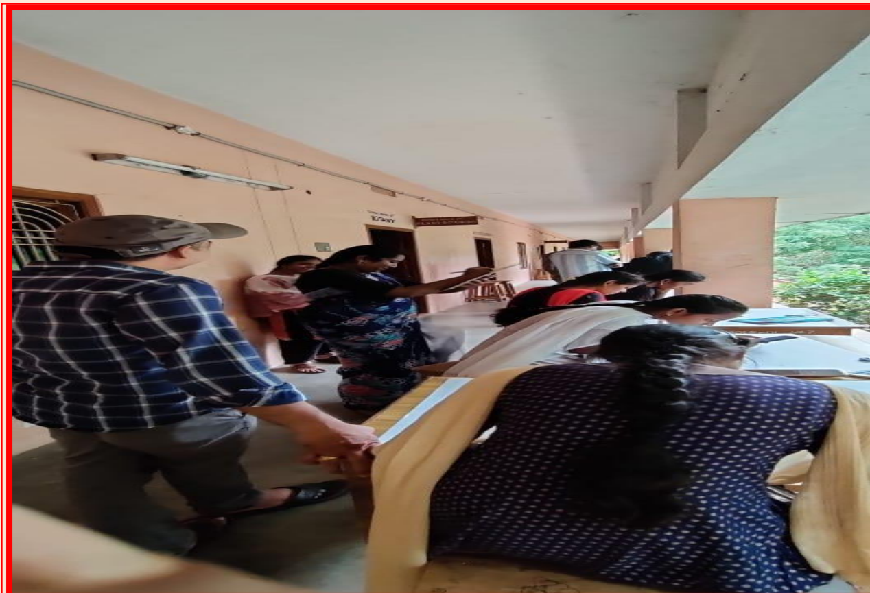
Our Students are making Poster Paintings so interestingly