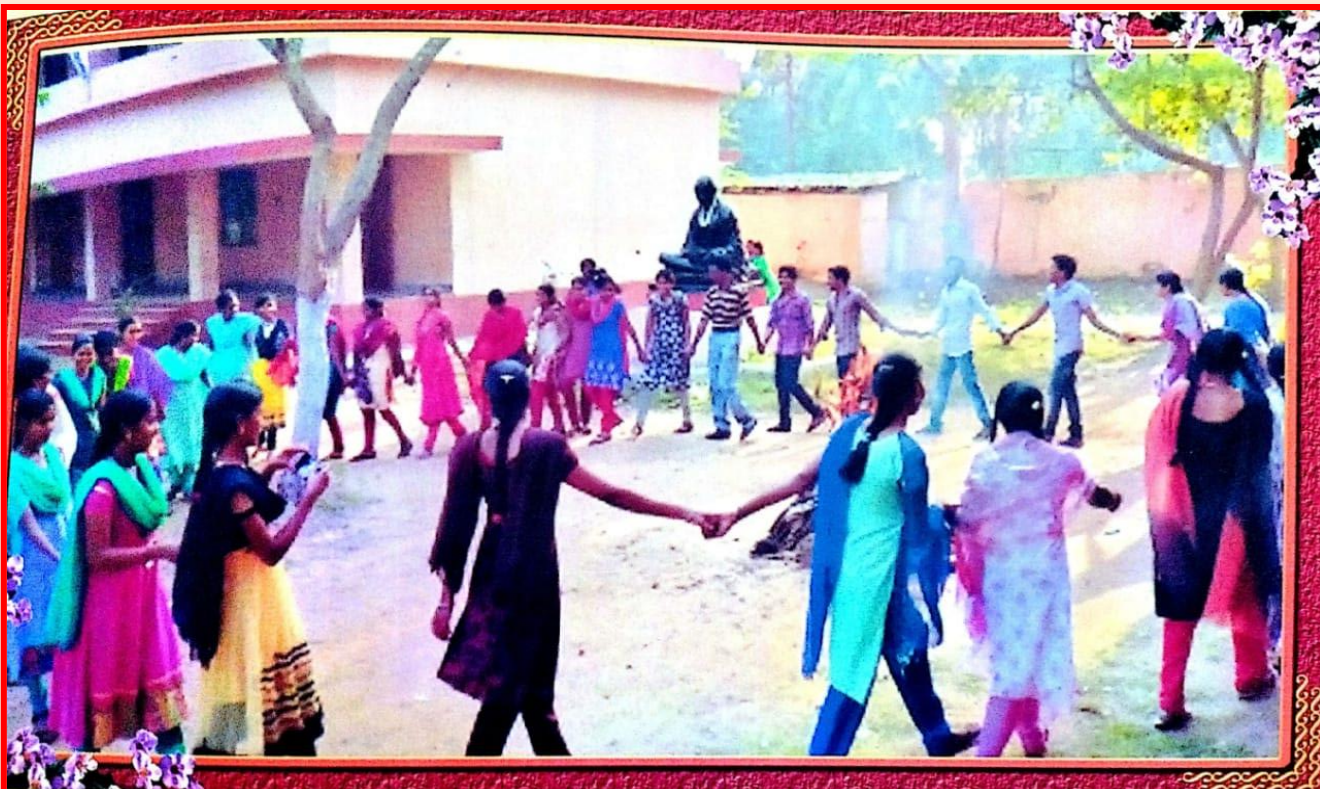
BHOGI CAMP FIRE

A Camp Fire was conducted on dt.08-01-2018 on the eve of celebrations of Bhogi Festival.