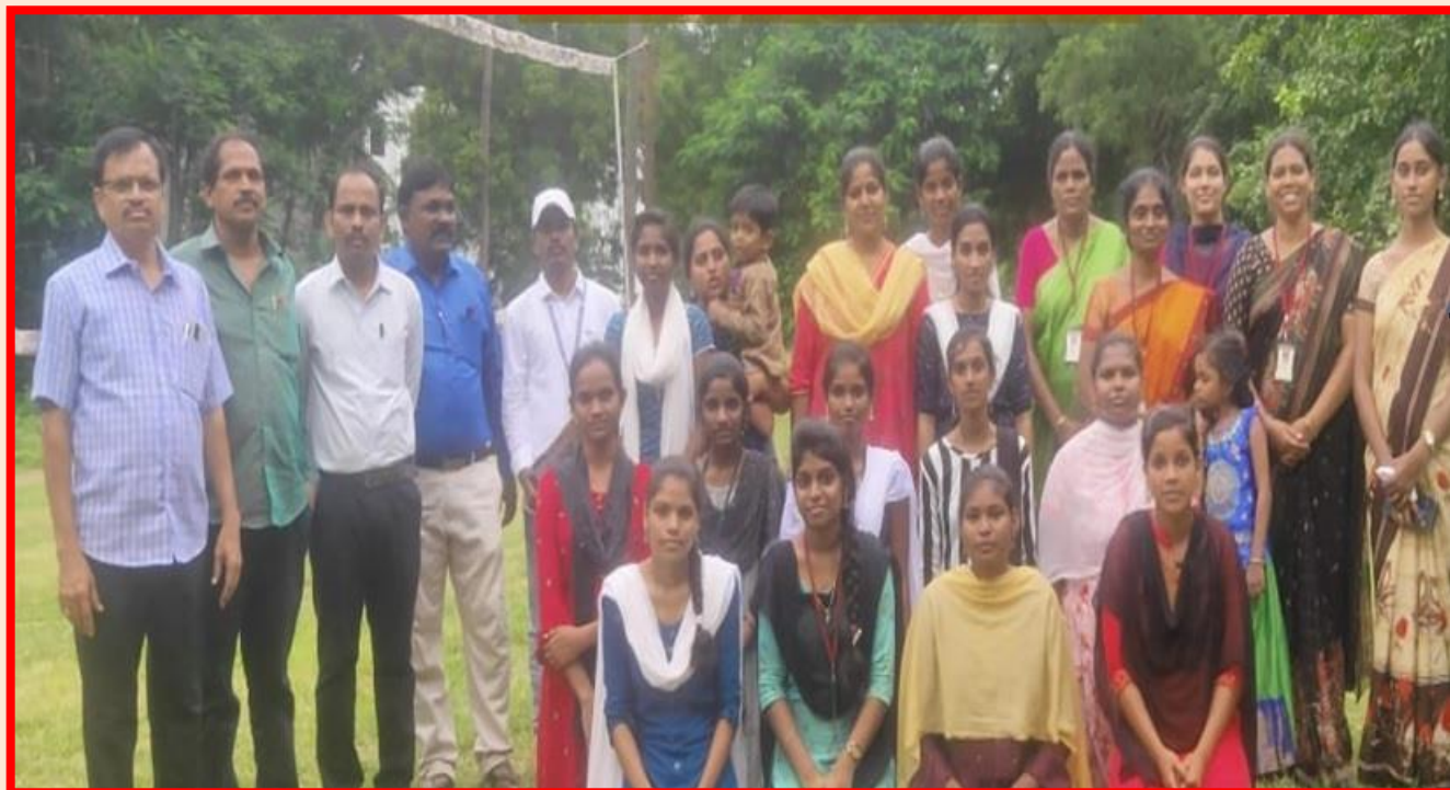
Winners & Runners of Throw Ball Game with the Respected Lecturers & Non-Teaching Staff