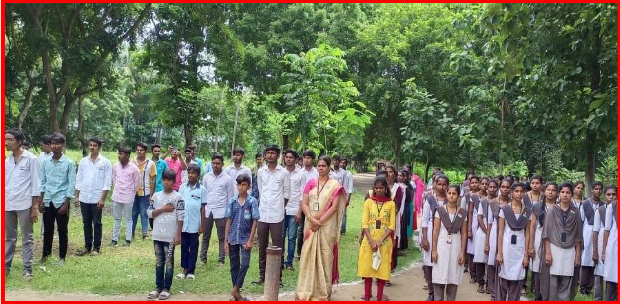
Our College Students, A few Students from various Schools were also participated in this Programme.