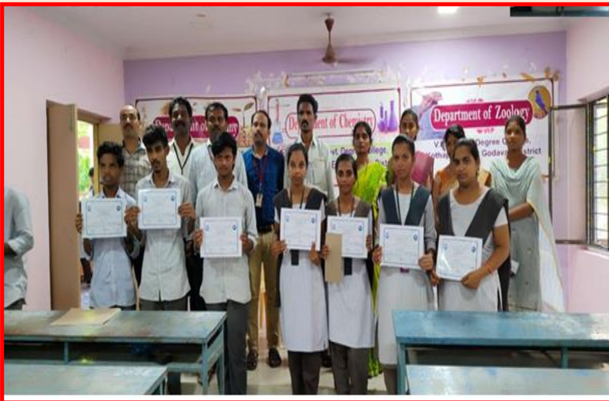
Our Students with their winning certificates of World Ozone Day Competition