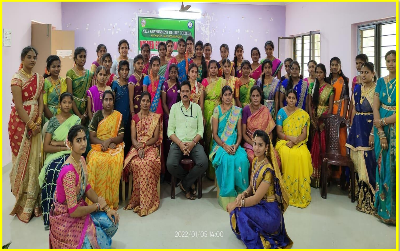
Our Hon'ble Principal Sir & Other Staff Members with the Girl Participants