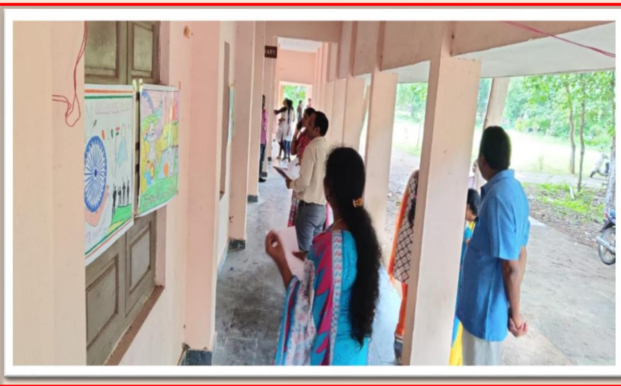
Our Respected Lecturers watching the Posters