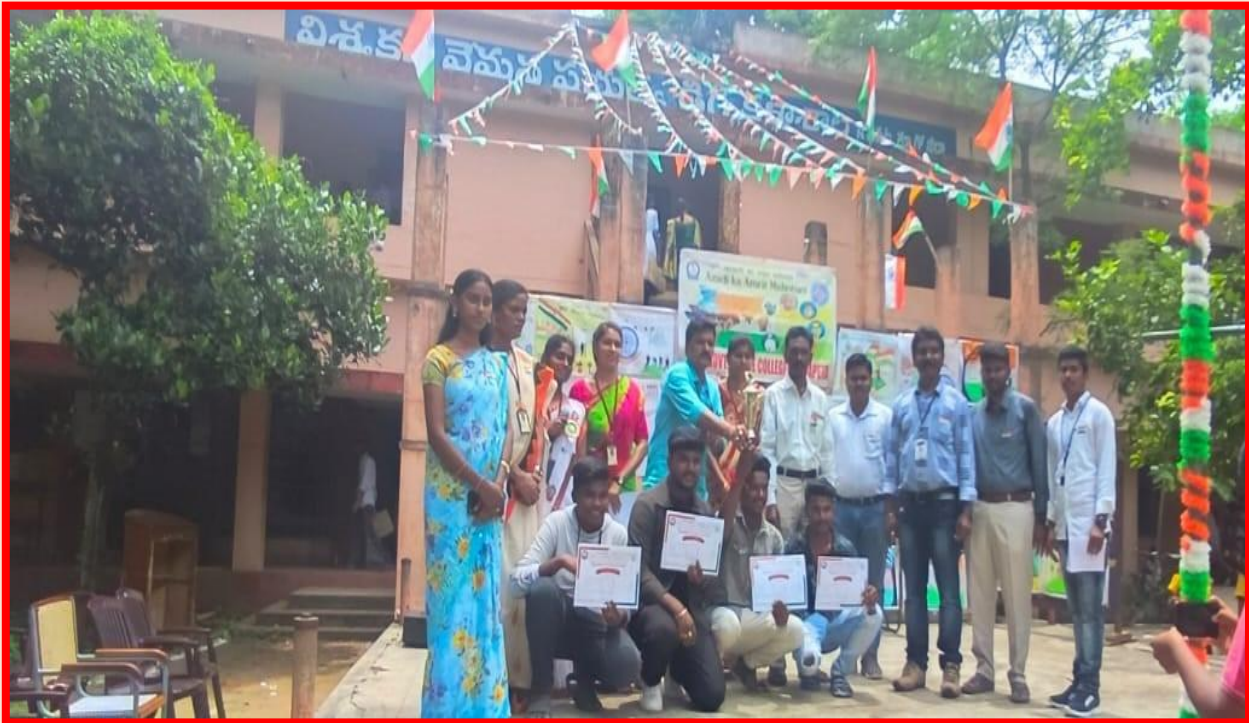
Certificates and Medals,Cups were presented to the Winners who were participated in various games & sports.