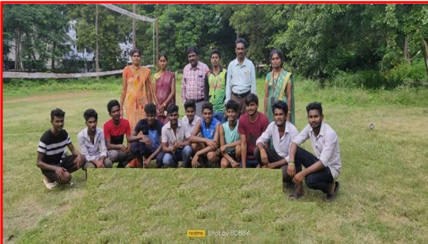
Winners & runners of Volley Ball Game with The Respected Lecturers