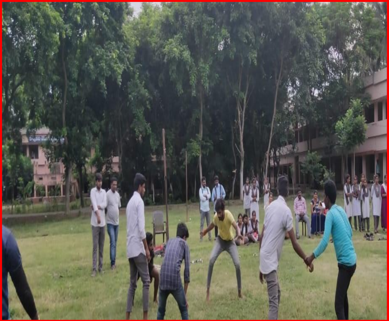
Group of Our beloved Student playing Kabaddi in dt.13-08-2021