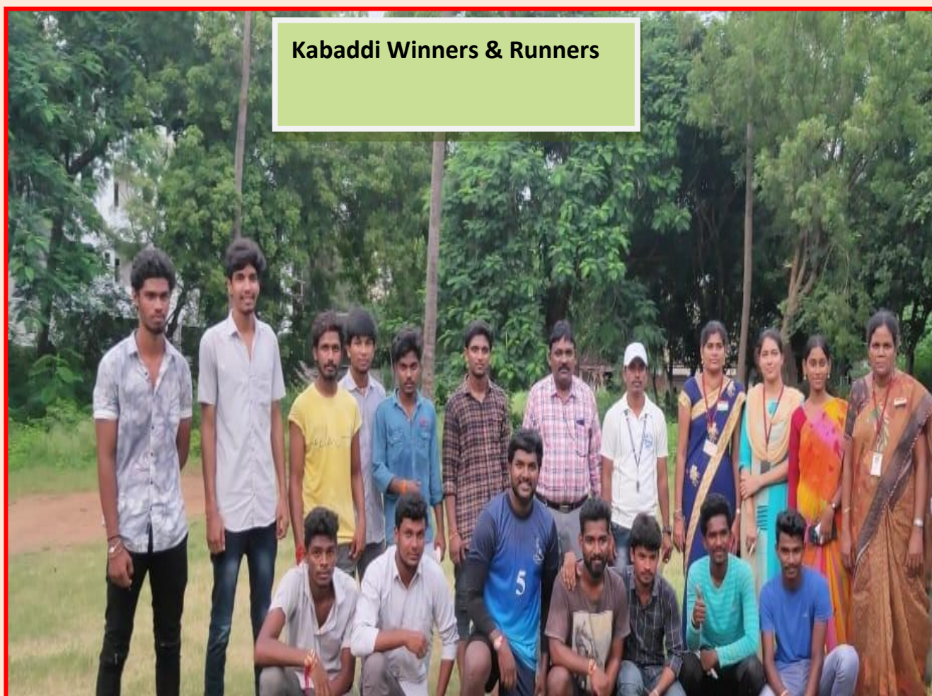
Winners & Runners of Kabaddi Team with Our Respected Lecturers.