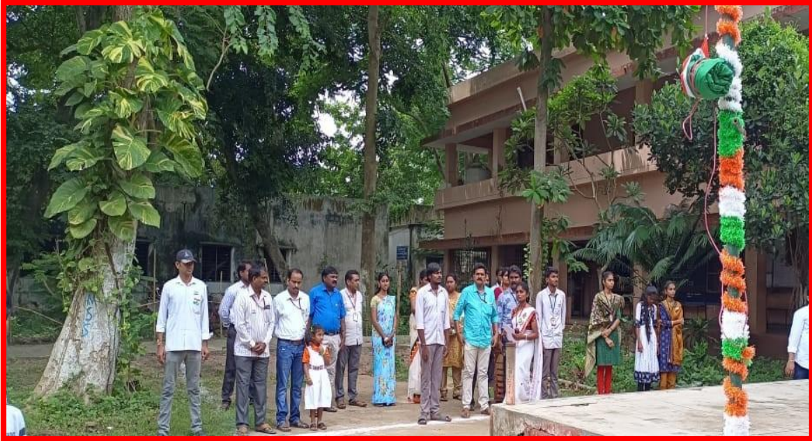
Our Hon'ble Principal Sir & other Staff members gathered for celebrating Independence Day