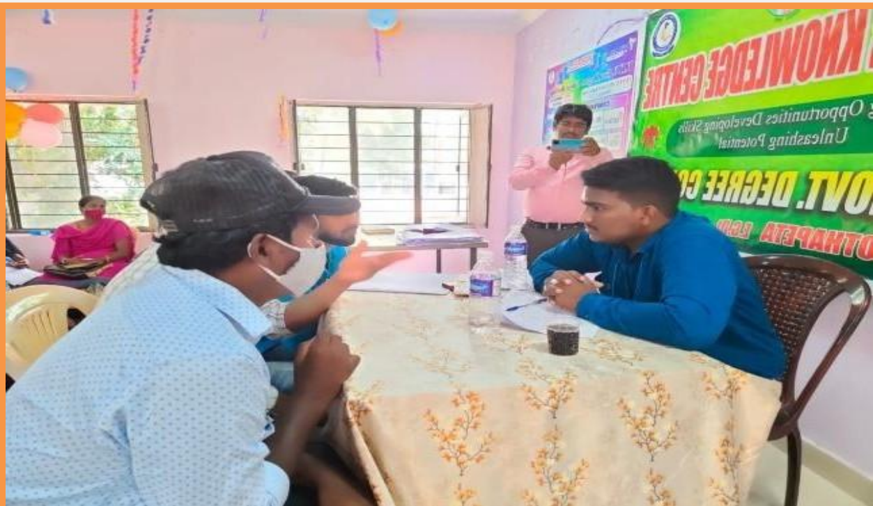
Respected Company HR Sir interviewing the Aspirants