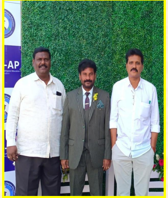
Our Hon'ble Principal Sir with the Dignitaries at SRR & CVR College, Vijayawada