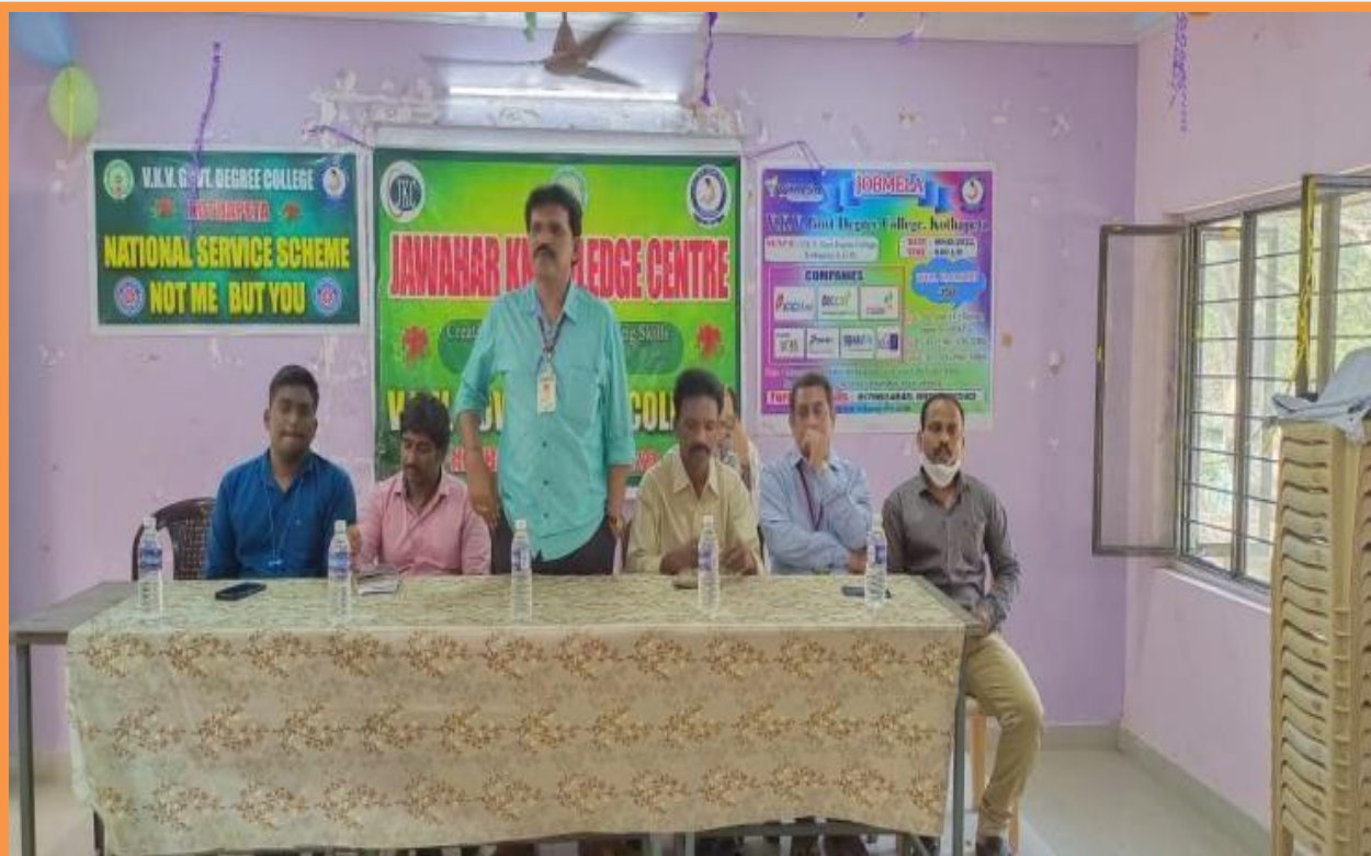
Our Hon'ble Principal Sir delivering his valuable speech on the eve of Mega Job Mela at VKVGDC,Kothapeta